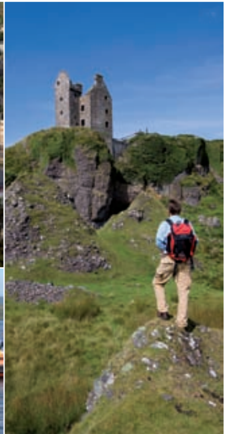
Port of plenty (clockwise from top): comings and goings in Oban Bay; Gyleen Castle, Kerrera; dolphin spotting; paddling on the River Etive