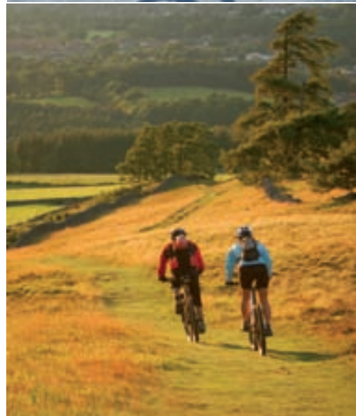
Tempting towns (from top): Oban Bay by night; learning to ski, near Aviemore; enjoying the trails, Peebles