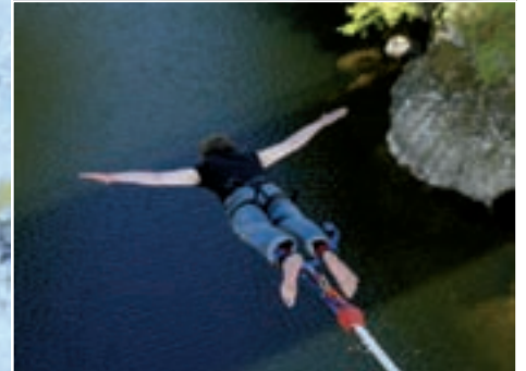
Wet and wild (clockwise from left): Highland Perthshire has some of the best whitewater rafting in Scotland; Pitlochry's picturesque main street; bungee jumping from the Garry Bridge