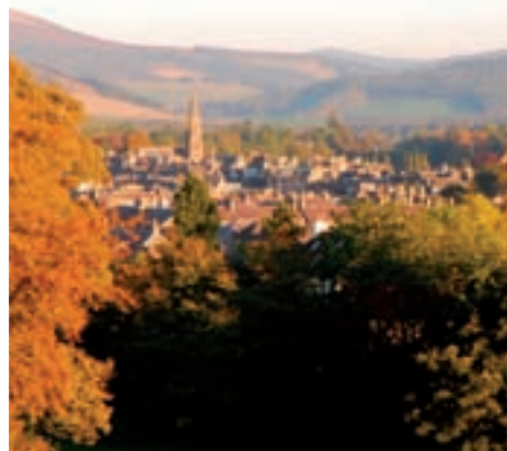
Jump to it (clockwise from top): a mountain biker at Glentress; Beltane Festival procession; Tweed Valley ospreys; Peebles in autumn colours

Culturally, a town and area that has strong links with the likes of John Buchan and Sir Walter Scott seems more alive than ever. The Eastgate Theatre provides a steady stream of entertainment, while a year peppered with festivals – from jazz to forest, arts, food and mountain biking (Tweedlove) – culminates in the annual Beltane Festival, a slightly