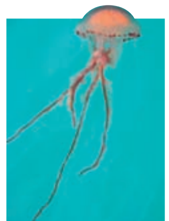
Life aboard (clockwise from opposite left): Eda at full tilt; rush hour at Mingulay; one of Eda 's ornate carvings; sailing across a benign Minch; jellyfish; puffins at the nest

At first, it is just a little grey smear on the horizon, but as we draw closer, it becomes a towering and savage island. There's little shelter for visiting craft on Mingulay. We anchor in the only bay on its eastern shore where a long grassy slope slips down to white sand and crashing surf. Beyond the dunes the land rises up on all sides to immense cliffs that fall away into a deep sea. The whole island